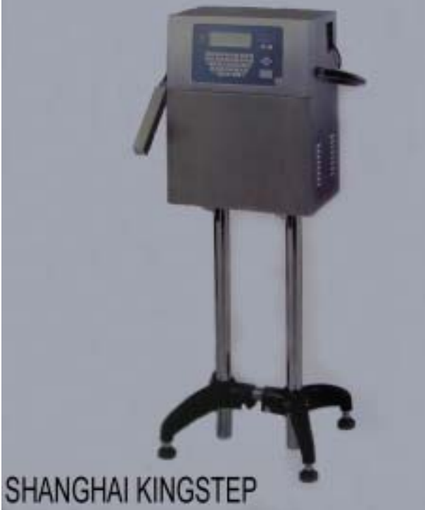
KSL label sleeving machine

(to label the bottles, and shrink them closed around the bottle body)