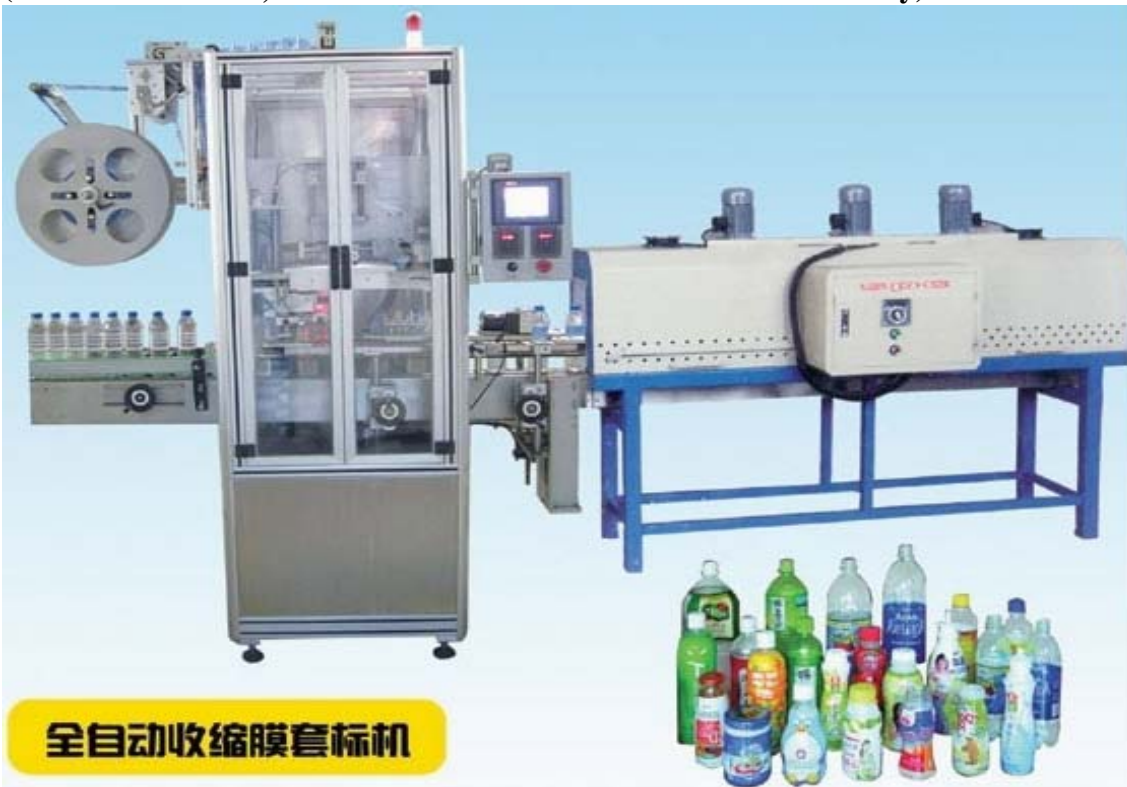
KSP800L shrink film packing machine

(to label the bottles, and shrink them closed around the bottle body)