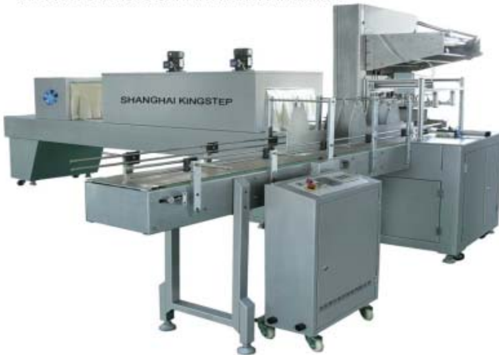
KSP800L FULL-AUTO SHRINK PARKING MACNINE

(to order the bottles according to the packing type 4X6, or 2X3 ...,then packed by shrink film, auto sealed, then enter the shrink tunnel, dealed by high temperature air, about 170~200 )